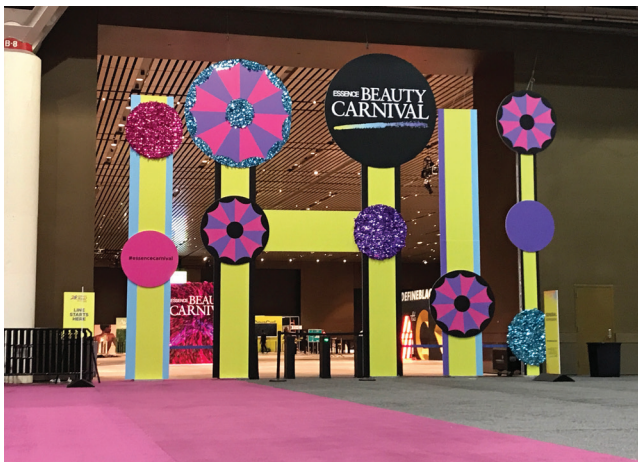
Essence Beauty Carnival™

Objective: Create a multi-faceted environment that builds excitement and sponsor revenue among the top beauty brands while driving consumer and social media engagement at the Essence Festival in New Orleans.